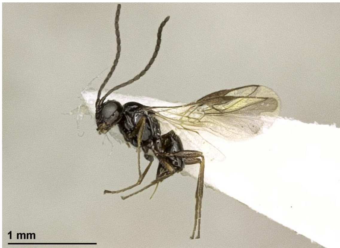
Figure 4. Phaedrotoma scaptomyzae (Fischer, 1967): habitus, lateral view (female).