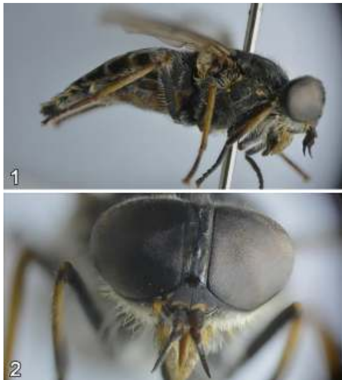
Figures 1-2. Tabanus armenicus (Krober, 1928) (Female): 1. Lateral view, 2. Frontal view of head.

Distribution: All European countries, Caucasus, China, Iran, Mongolia, Russia, Turkey.