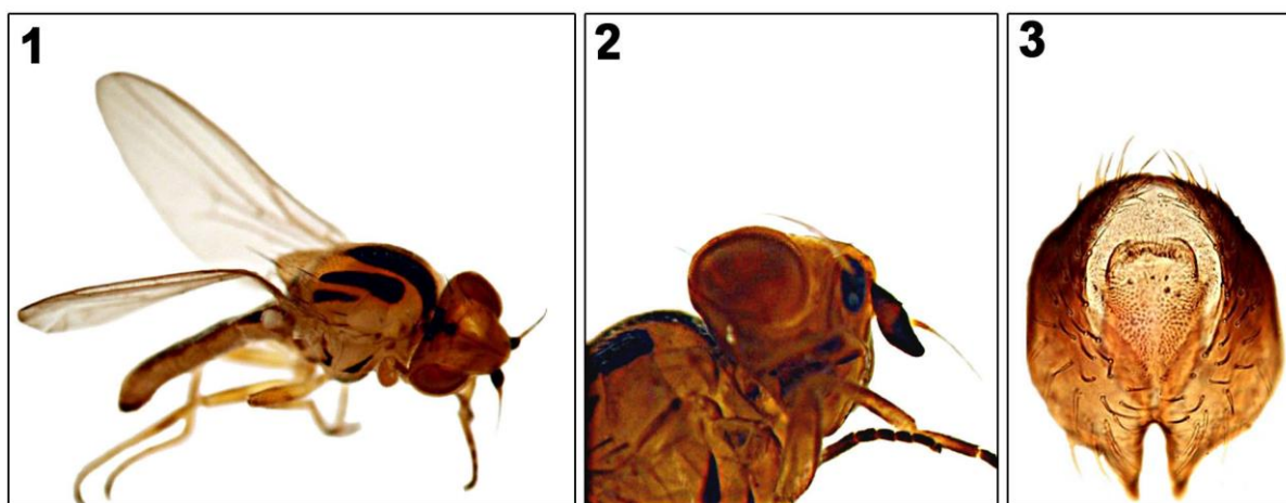
Figures 1–3. Lagaroceras curtum Sabrosky, 1961 (male): 1. Lateral view, 2. Lateral view of head, 3. Caudal view of epandrium.

Distribution: Widespread; Iran (Narchuk et al. 1989; Modarres-Awal 2011).