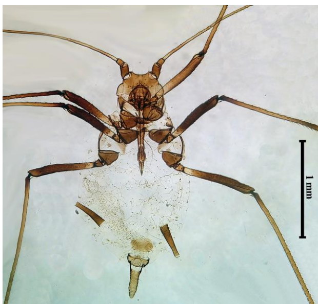
Figure 2. Habitus of apterous viviparous female of Macrosiphoniella frigidivora Holman & Szelegiewicz, 1974.