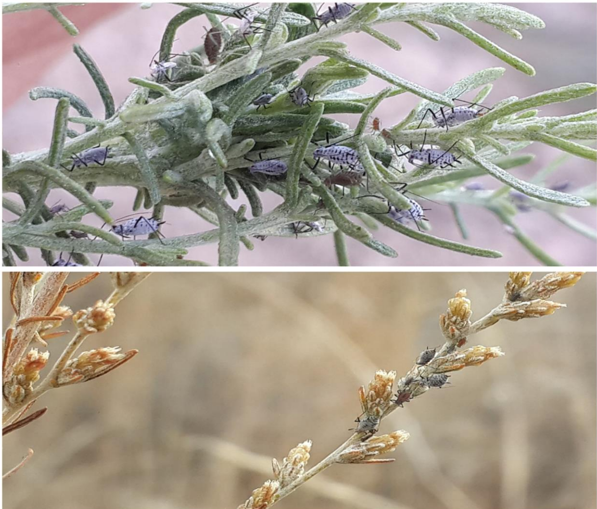
Figure 1. Macrosiphoniella frigidivora Holman & Szelegiewicz, 1974 colonies on terminal parts of the shoots of their host plants, Artemisia spp.