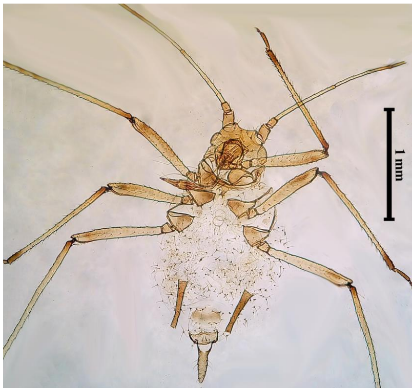
Figure 3. Habitus of apterous viviparous female of Macrosiphoniella szalaymarzsoi Szelegiewicz, 1978.

Distribution: Hungary (Szelegiewicz, 1978) and Kazakhstan (Kadyrbekov, 2004).