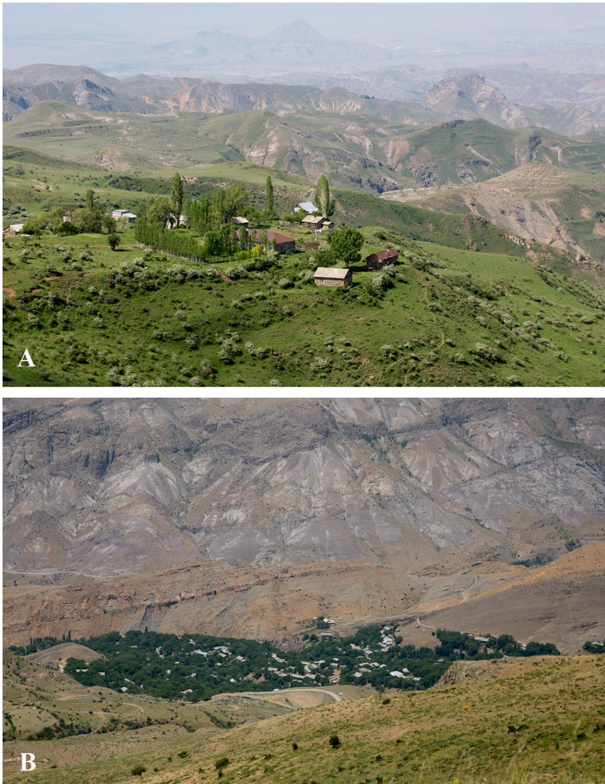
Figure 2. Collecting place of Catocala lesbia lesbia . A. Agdere, Ordubad district, Nakhchivan AR, Azerbaijan; B. Village Tivi, located about 7 km SE Agdere.