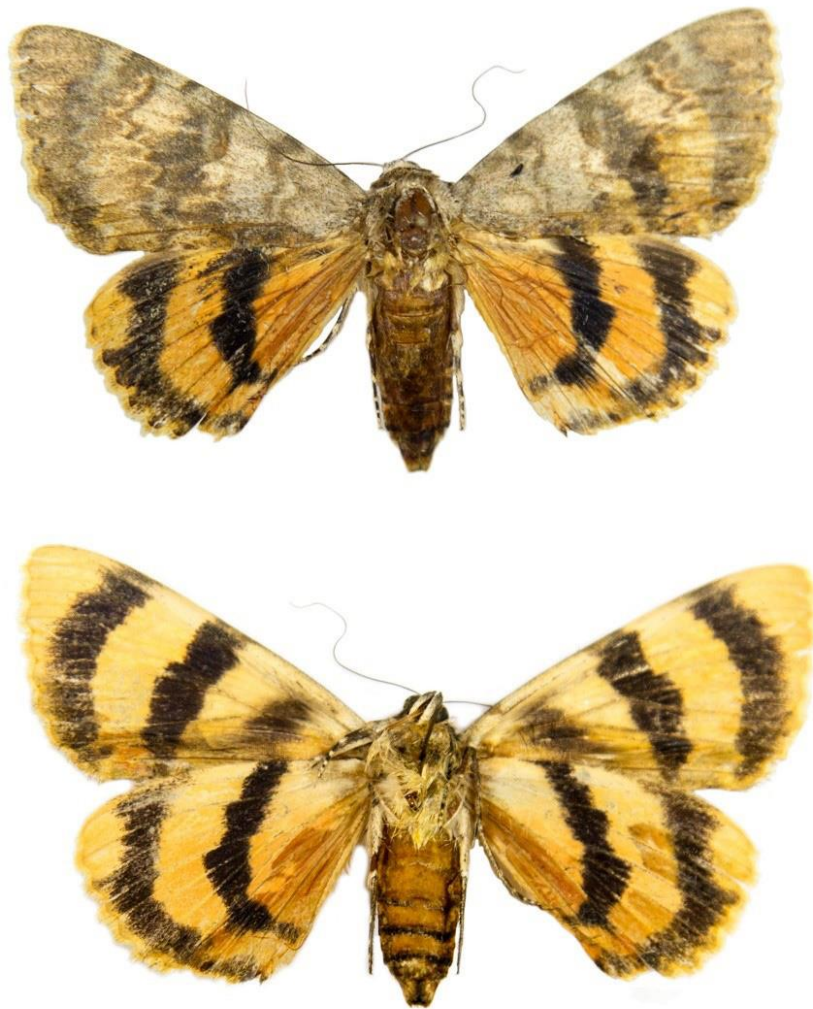
Figure 3. Catocala lesbia lesbia , adult male in dorsal (up) and ventral (down) views.

Collecting place: Agdere is located in the Ordubad district of the Nakhchivan AR. The place is a former branch of the Pulkovo Observatory, located at an altitude of about 2000 m above sea level (Figs. 1A, B, 2A, B). The vegetation cover of the area is consisted of mountain xerophytic (friganoid) mainly perennial plants. Associations are made by different species of Acantholimon Boiss. (1846), Astragalus L., 1753 and Thymus L., 1753, and hawthorn Crataegus Tourn. ex L. and rose hip Rosa L. dominate among the bushes (Ibrahimov et al., 2017). On the territory of the former observatory there are poplars ( Populus sp.) planted in a row, where the development of caterpillars of this species is quite possible. In addition, at a distance of about 7 km SE this site is the village of Tivi, where there are also poplar plantings along the rivers. In addition, in gorges along small rivers where local species of stunted poplar can grow, it is also possible to find this species.