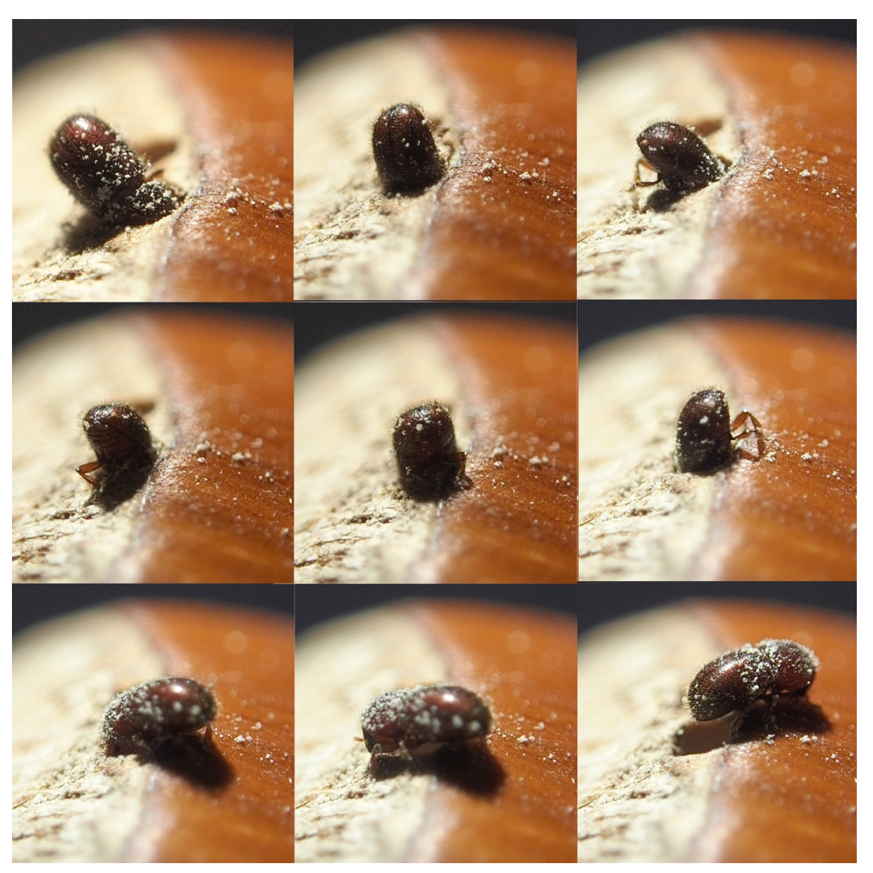
Figure 3. Abandoned penetration attempt into Corylus avellana . Stills from a video.