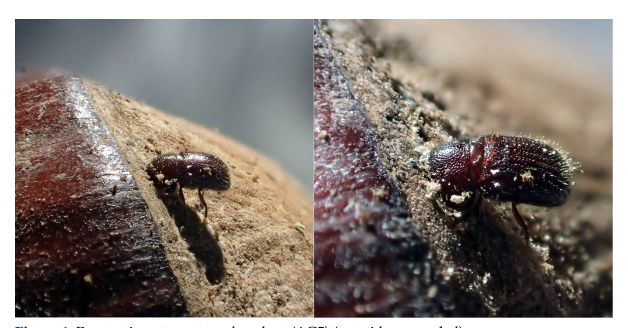
Figure 1. Penetration attempt to a hazelnut (AG5) (not video-recorded).