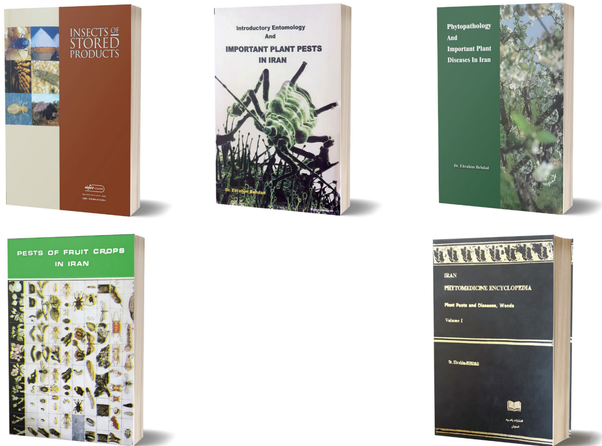
Figure 5. Some of the key books authored by Professor Ebrahim Behdad.