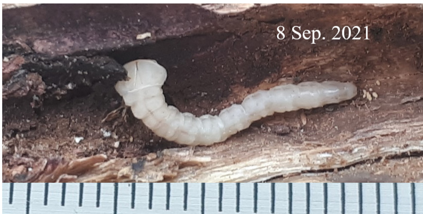
Figure 1. The larva of Sphenoptera orichalcea inside the root of H. strobilaceum (saline lands around the Soldoz wetland, West Azarbaijan, Iran).

Chrysoblemma Jakovlev, 1889, which is characterized by the same structure of elytral apices. All other species of the subgenus from Iran and Armenia except of S. tristicula Reitter, 1895 have smooth and shiny dorsal integument; pronotum in these species is widest behind middle, with sides more or less divergent towards sharp posterior angles. Sphenoptera tristicula with structure of dorsal integument similar to S. orichalcea is black with more or less distinct bluish reflection, pronotum spheroidal with disk nearly regularly convex.