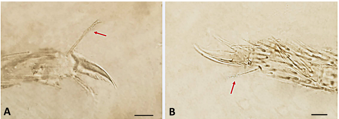
Figure 4. Pseudosinella spp. (Entomobryidae) on slide; A. Pseudosinella cf. decipiens tibiotarsus with dorsal clavate tenent hair; B. P. immaculata tibiotarsus with dorsal pointed tenent hair. Scale bar: 10 µm.