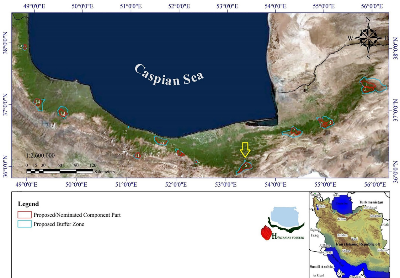
Figure 1. Map of Hyrcanian forests in northern Iran including Bula forest (6) in Farim city located in Sari region in Mazandaran province.