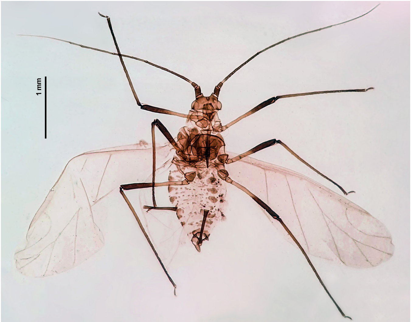
Figure 1. Habitus of Uroleucon carthami (Hille Ris Lambers, 1948), alate male.

First tarsal segment with 5:5:5 setae. HTII 0.10–0.13 mm, 0.14\text{--}0.16 \times \text{PT} and 0.62\text{--}0.72 \times \text{ANTVIb} . Abdomen membranous, with oval marginal sclerites containing very small marginal tubercles and fine setae with pointed apices. ABDTVIII with (3)4–5 long setae. SIPH with ante- and post-siphuncular sclerites (Fig. 2F). SIPH 0.47–0.58 mm, tubular, slightly tapering, with subapical reticulation covering 15–21% of the distal length of SIPH (Fig. 2H). SIPH 2.18\text{--}2.70 \times \text{Cauda} , 0.20\text{--}0.25 \times \text{BL} , 0.67\text{--}0.76 \times \text{ANTIII} , 0.64\text{--}0.81 \times \text{PT} , 2.64\text{--}3.22 \times \text{URS} , 4.21\text{--}5.02 \times \text{HTII} and 0.94\text{--}1.13 \times \text{HW} . Cauda long-triangular, 0.17–0.24 mm long, 0.37\text{--}0.48 \times \text{HW} , 0.99\text{--}1.34 \times \text{URS} , 0.07\text{--}0.10 \times \text{BL} , with (15)17–22 fine long setae mostly on its apex. Parameres long triangular covered with fine, pointed setae. Basal part of phallus as long as or slightly longer than parameres (Fig. 2J).