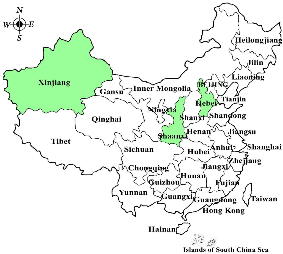
Figure 1. Distribution of Limothrips species in China.