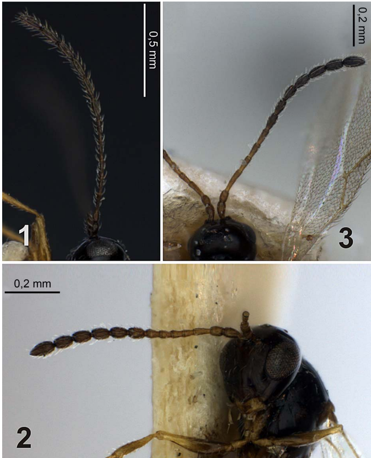
Figures 1-3. Antenna of female. 1. Hexacola hexatoma (Hartig, 1841); 2. Hexacola bifarium Quinlan, 1986; 3. Hexacola bonaerensis Reche nom. nov.