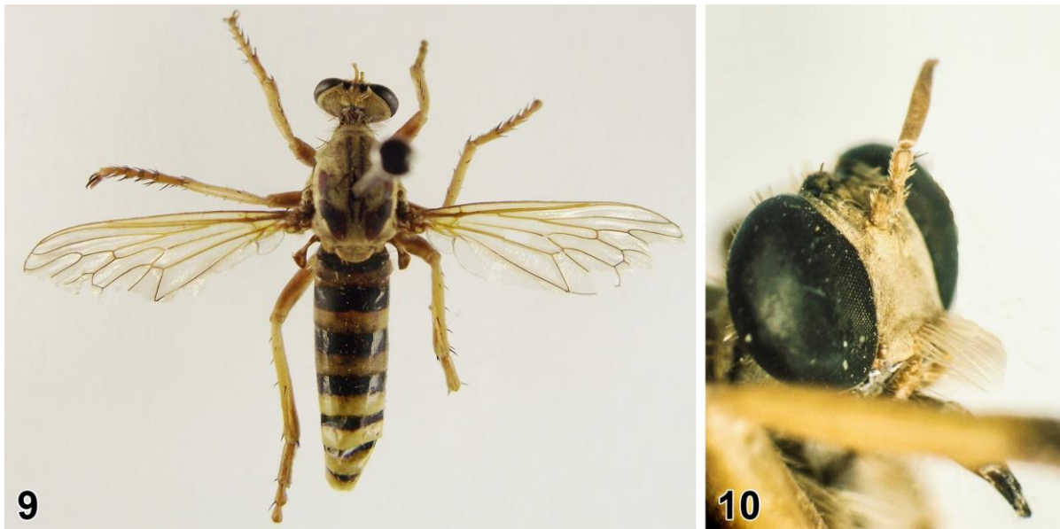
Figures 9–10. Saropogon megriensis Richter, 1966, female: 9. dorsal view, 10. head, lateral view.