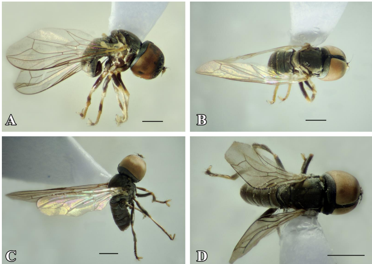
Figure 2. Dasydorylas discoidalis female (voucher specimen BM121): A. in lateral view, B. in dorsal view; Eudorylas jenkinsoni female (voucher specimen BM123): C. in lateral view, D. in dorsal view. Scale bars: 1 mm.

Distribution: New record for Iran. The known distribution was limited to Russia so far (Kehlmaier, 2005a).