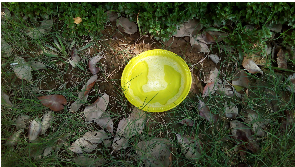
Figure 2. A yellow pan trap, by which the chalcidoids were collected.