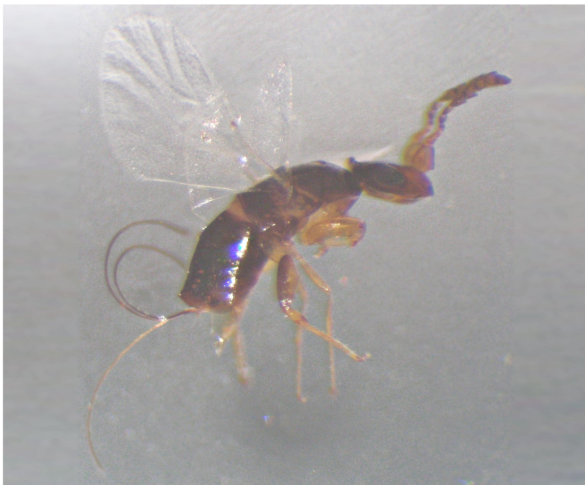
Figure 3. Female Eupristina saundersi Grandi, 1916 (40 X)

Host association in Iran: Parasitoid of Aleurocanthus spiniferus , Aleurocanthus woglumi Ashby and Bemisia tabaci (Hemiptera: Aleyrodidae) (Abd-Rabou et al. 2013).