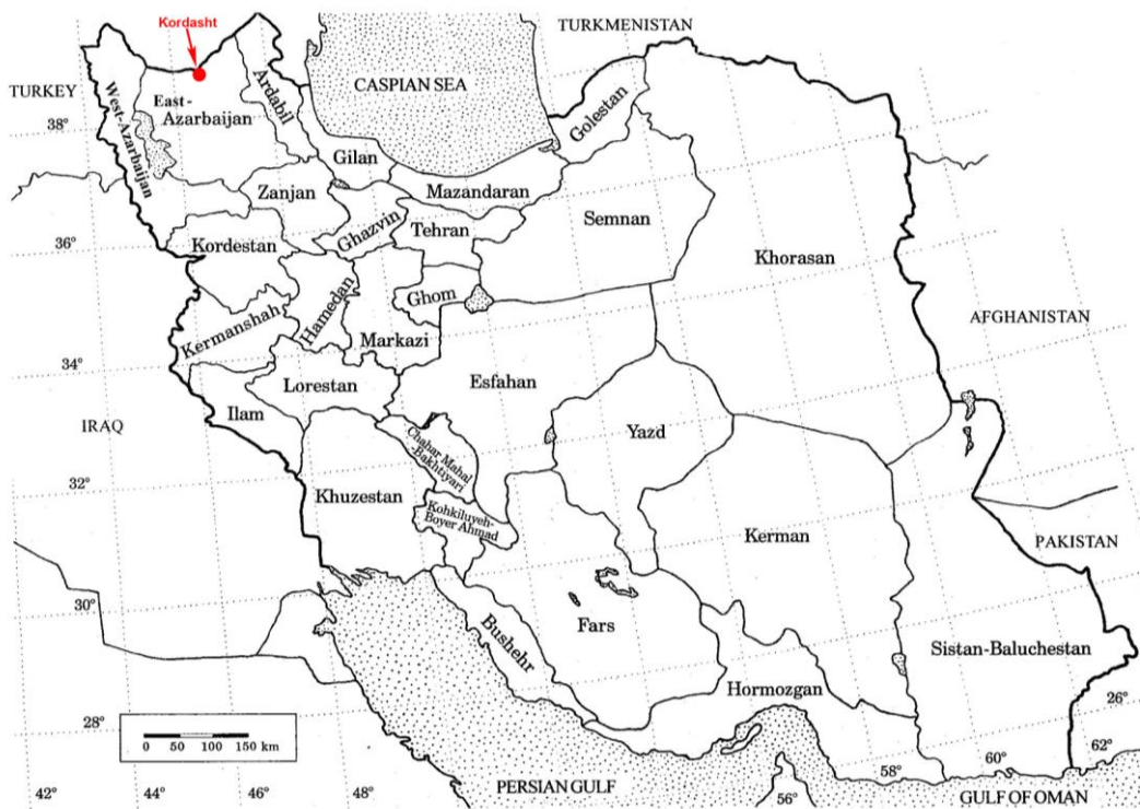
Figure 2. Map of Iran including collection site of Ephedromyia debilopalpis in the northeast.