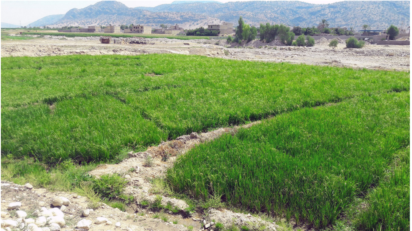
Figure 1. Habitat and collecting site of Parawenhoekia aginapaica (Haitlinger, 1999) in Fars Province, Iran with its vegetation cover.

Distribution. Cyprus, Iran ( new country record )