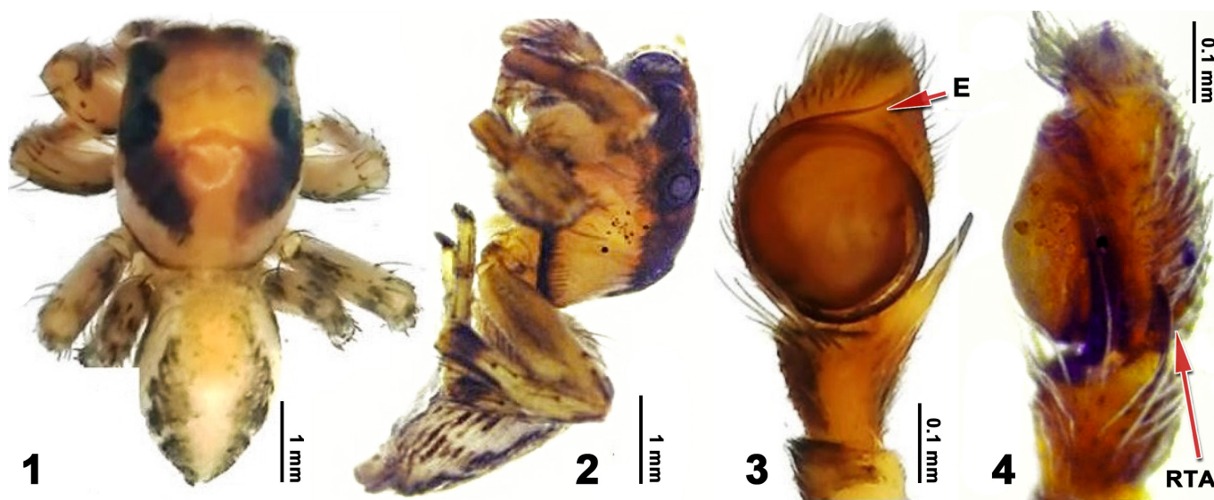
Figures 1–4. Evarcha pulchella (Thorell 1895), male. 1. Habitus, dorsal view; 2. Habitus, lateral view; 3. Palp, ventral view; 4. Palp, retrolateral view. E = embolus, RTA = retrolateral tibial apophysis.

Female (PAA#2022-06-143). Habitus as in Figures 5–7. Carapace length 2.33, width 1.98, height 0.99. Ocular area widest at PLE row; 1.89, width PME row 1.66, AER width 1.76. Abdomen length 2.38, width 1.89. Leg I: 4.07 (1.26, 0.66, 0.96, 0.62, 0.57). Leg II: 3.64 (1.16, 0.73, 0.65, 0.59, 0.51). Leg III: 5.04 (1.74, 0.83, 0.96, 0.87, 0.64). Leg IV: 3.97 (1.29, 0.57, 0.79, 0.83, 0.49).