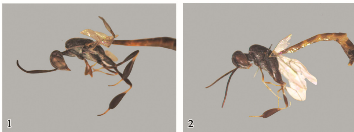
Figures 1-2. Gasteruption sericeipes Kieffer, 1911, 1. Female; 2. Male.

Material examined: ♀, IRAN, Fars: Kherameh, Char Tag (29°30'42.0" N, 53°18'55.0" E), 1588 m a.s.l., pomegranate orchard, Punica granatum L. (Lythraceae), 12.VI.2013, leg. E. Izadi; 1♂, 25.VI.2013; 1♀, Kherameh (29°30'51.0" N, 53°18'40.0" E), 1595 m a.s.l., pomegranate orchard, P. granatum , 15.VI.2013, leg. E. Izadi; 1♂, 24.VI.2013; 1♂, 25.VI.2013; 1♂, Shiraz, Bustan-e Jannat (29°36'52.0"N, 52°28'09.0"E), 1584 m a.s.l., pomegranate orchard, P. granatum , 2.VI.2014,